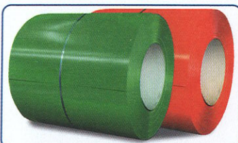
COLOUR COATED COILS