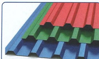
COLOUR COATED ROOFING SHEETS