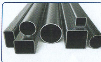
ERW MS PIPES AND GP PIPES