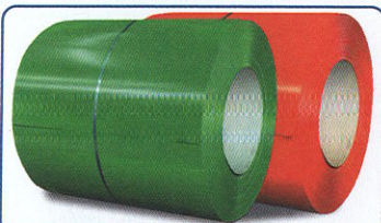
COLOUR COATED COILS